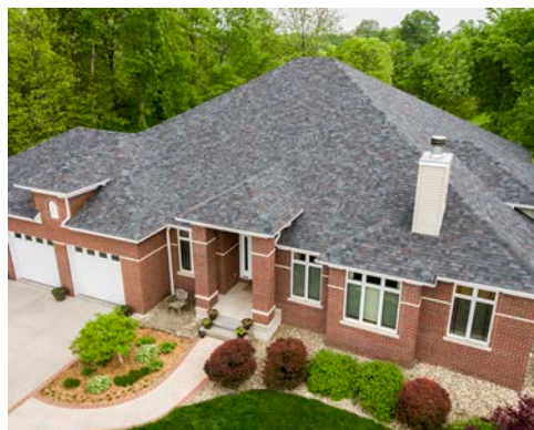
Figure 1 - Legacy Shingles