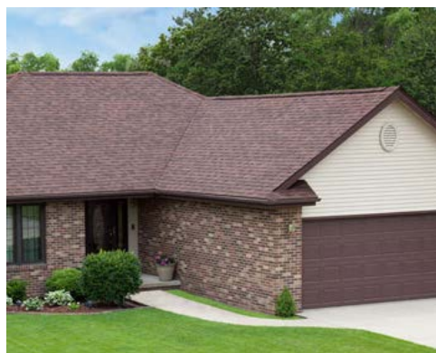
Figure 2 - Legacy Scotchgard

Manufacturing Location: Portland, OR; Southgate, CA; and Oklahoma City, OK