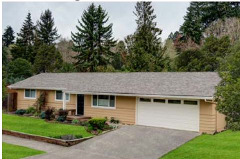
Figure 1 - Vista Shingles

Vista® is an architectural shingle line fortified with sustainable NEX® polymer modified asphalt technology for enhanced granule adhesion and extreme weather protection, including Class 3 impact resistance.