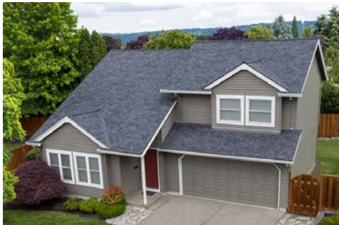
Figure 2 – Vista AR Shingles

Manufacturing Location: Portland, OR and Southgate, CA