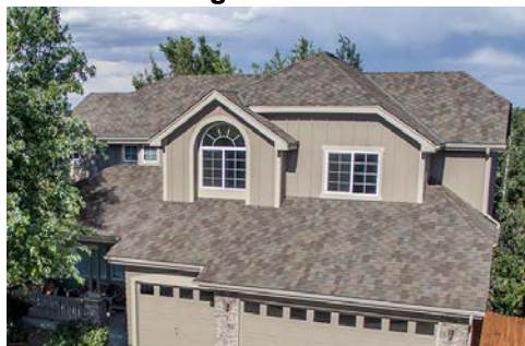
Figure 1 - Windsor Shingles

The Windsor® designer shingle offers the look of a traditional cedar shake roof with the fortified durability of NEX® polymer modified asphalt technology to promote superior granule adhesion and extreme weather protection, including Class 4 impact resistance.