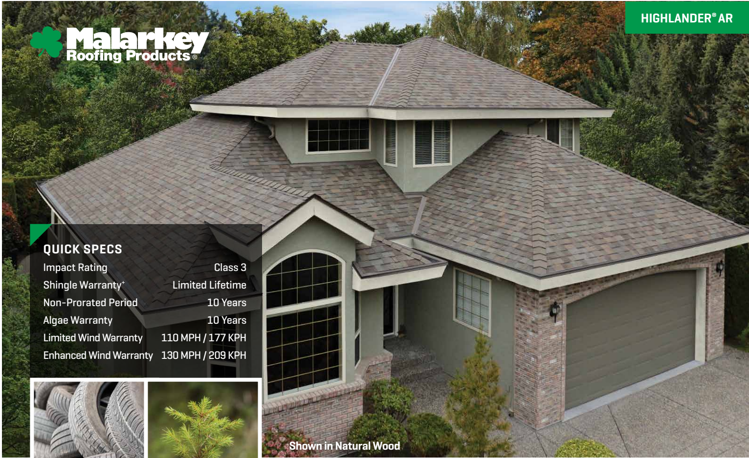
Shown in Natural Wood