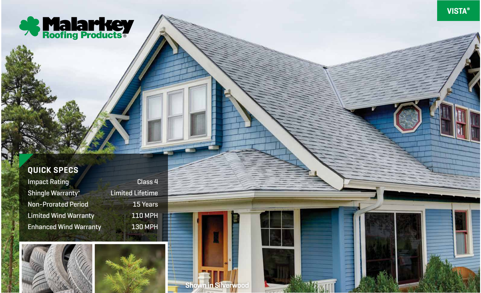
Shown in Silverwood