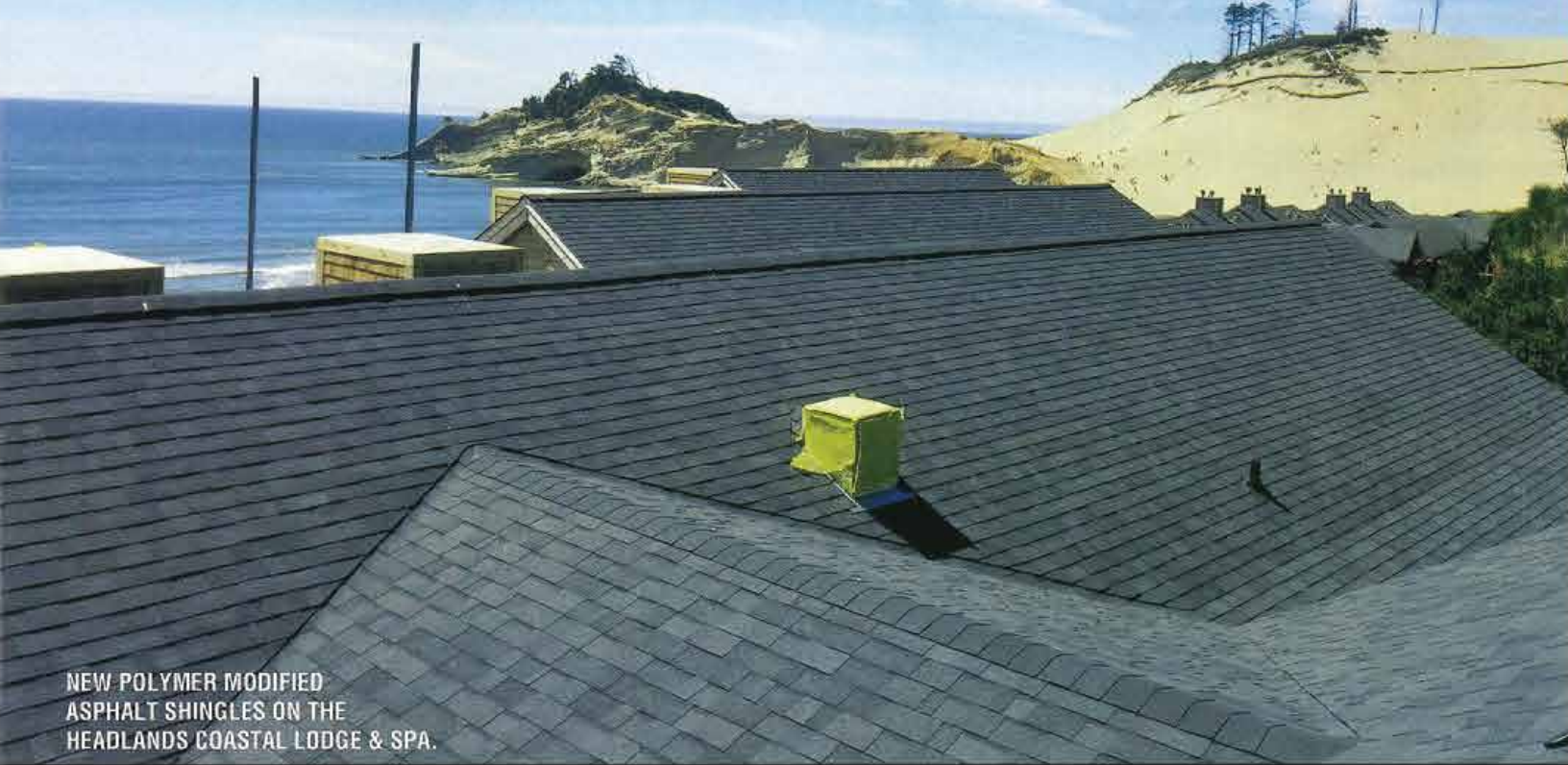
NEW POLYMER MODIFIED ASPHALT SHINGLES ON THE HEADLANDS COASTAL LODGE & SPA.

dramatic fluctuations between seasons. Roofing contractors in the area may find themselves installing shingles on a roof in 30°F during the winter, or 90°F in the summer. The Legacy shingle remains one of Malarkey's most popular lines, largely due to its construction with exceptional polymer modified asphalt. The polymer modified asphalt not only retains flexibility down to 0°F, which is 40° lower than the typical installation of standard asphalt shingles, it also provides unparalleled granule retention to limit UV degradation over the lifetime of the shingle. While the Oregon coast may see fog in the winter months, summers can be bright and